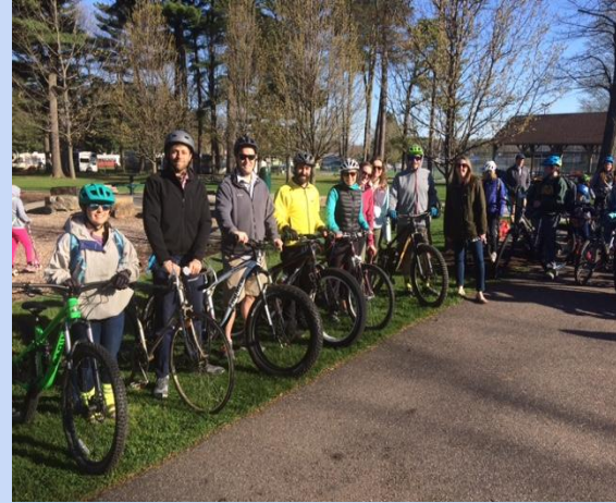
MBS Staff at Bike to School Day!

Reflection will be an important part of the new placement process. We will have an opportunity to reflect on the process in October of next year. We will also take some time this Thursday to reflect on the process. Here are the questions we'll use to guide our discussion.