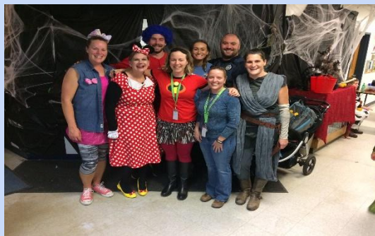
MBS Staff Picture at the Monster Mash.

The PBIS Universal Team met on November 12 to review our Trimester 1 behavior data. Some themes in the data emerged, including a spike in referrals from 11:15 - 1:00 school wide. To help address this we are going to "token up" and empower some of our students to hand out tokens during these times. We are also going to work on making the lighting in the cafeteria less over-stimulating for students. Please also be present in the hallway when your students are transitioning during this time to provide tokens for respectful behavior and to remind students of the hallway expectations.