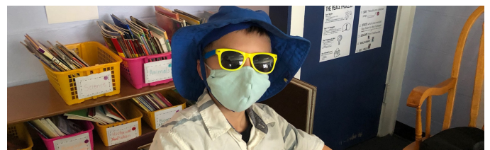
Above are pictures of our Spirit Week, including Workout Wednesday, Dress Like and Olympian Day, Tourist Tuesday and our Rock, Paper, Scissors Schoolwide Celebration Tournament!