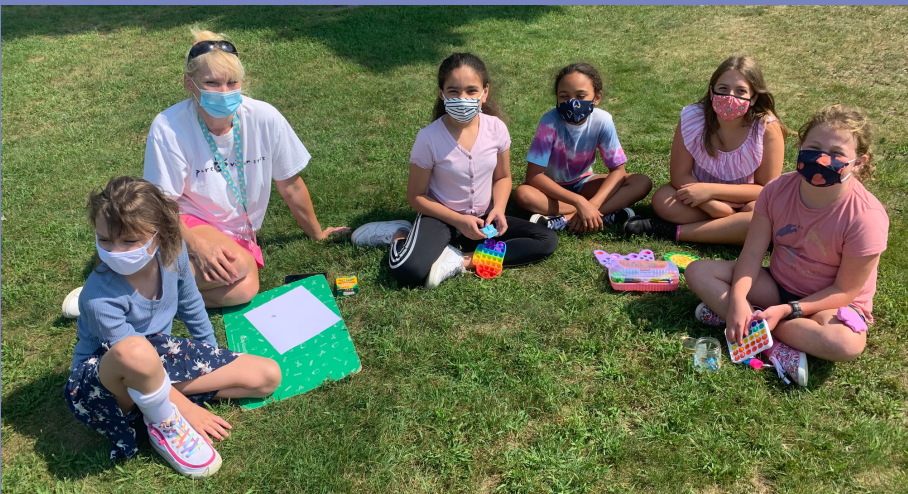
A group of students in Mrs. Fischer's class spends some time outdoors.