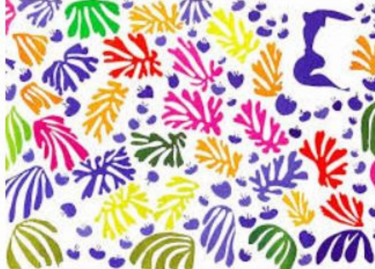
PIP & POP